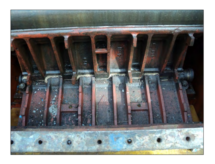
Toggle and pitman before removal and inspection.