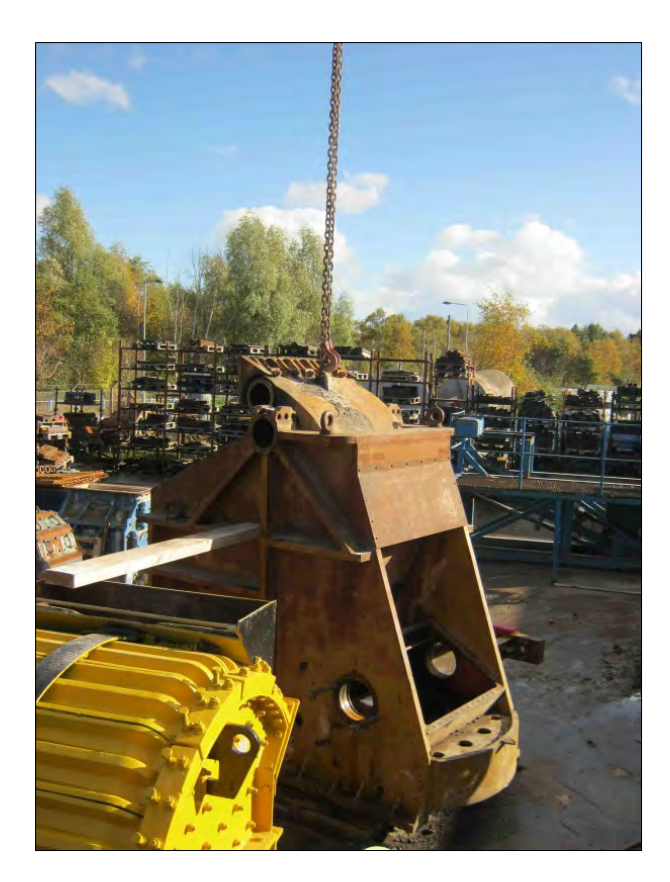
Lifting Out Jaw Stock