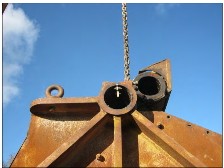
Work Starts Striping out hinge pin and eccentric shaft