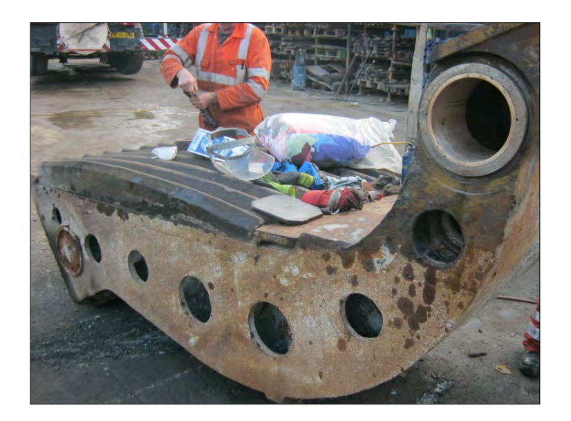
Jaw stock checked and ready to be refitted.