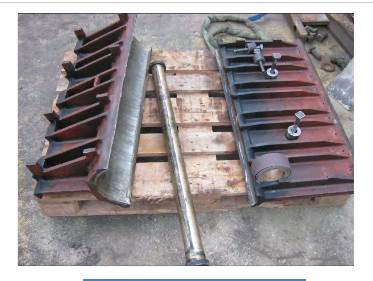
Toggle Plates & Pin Removed