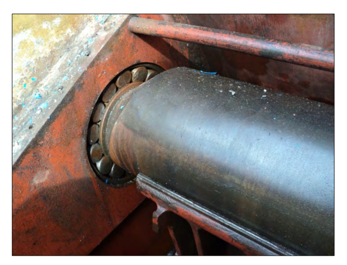
Bearings rusted and in poor condition due to lack of lubrication.