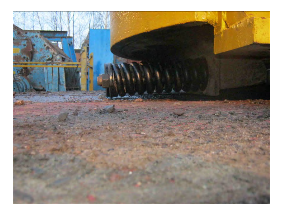
New draw back rods and springs fitted