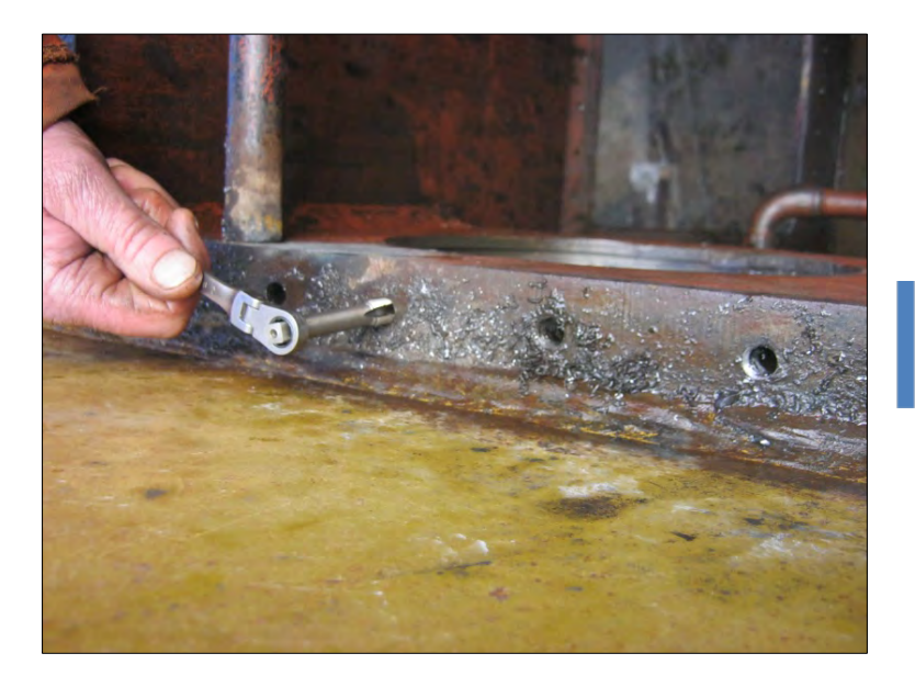
Re-tapping toggle cover plate holes to ensure the cover plate is sealed