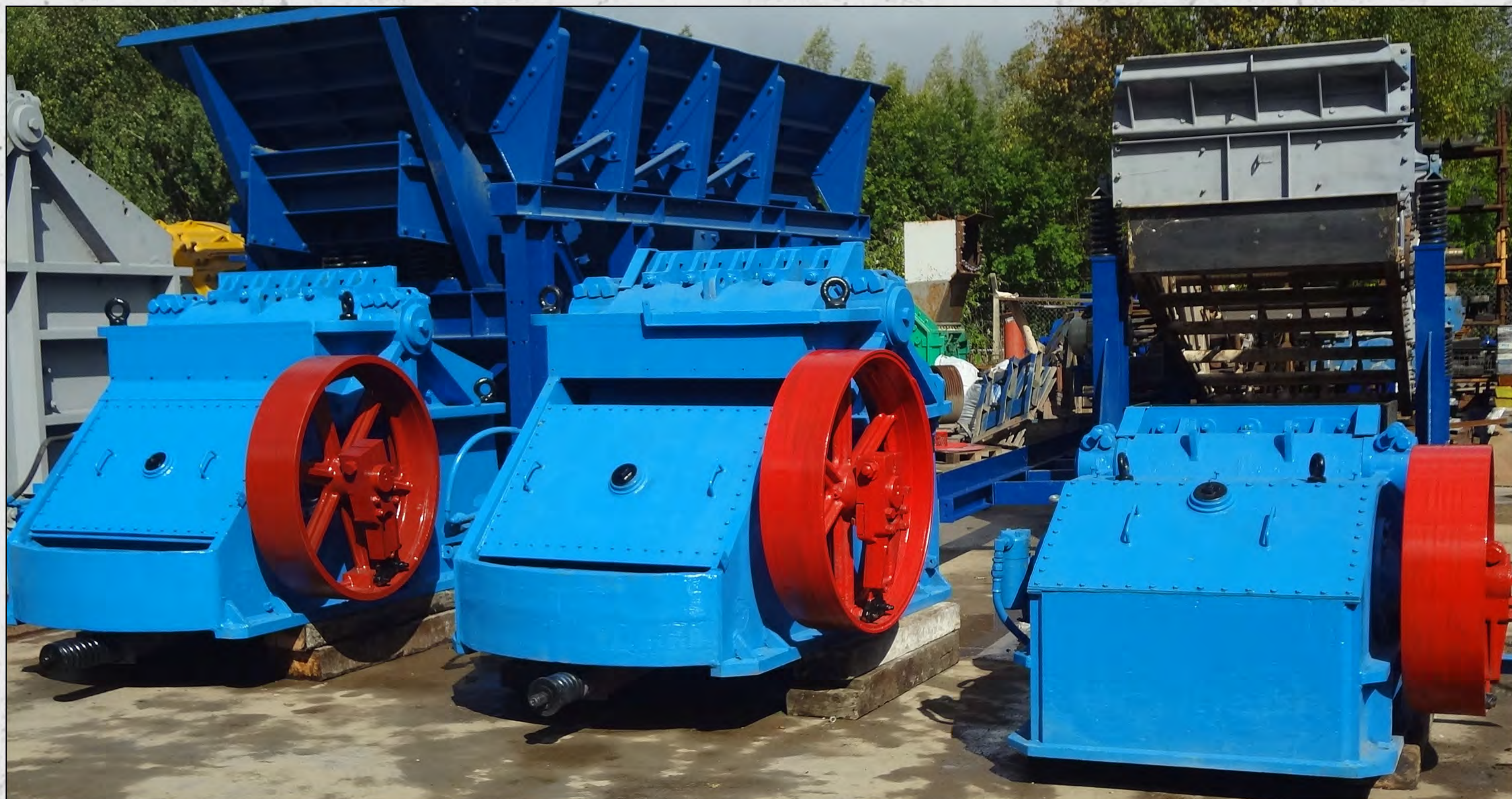
2 x Kue Ken 42 x 10 & Kue Ken 36 x 6 fully refurbished for a client in East Africa

Specialists in new and used Crushers & Screens, suppliers of quality wear parts