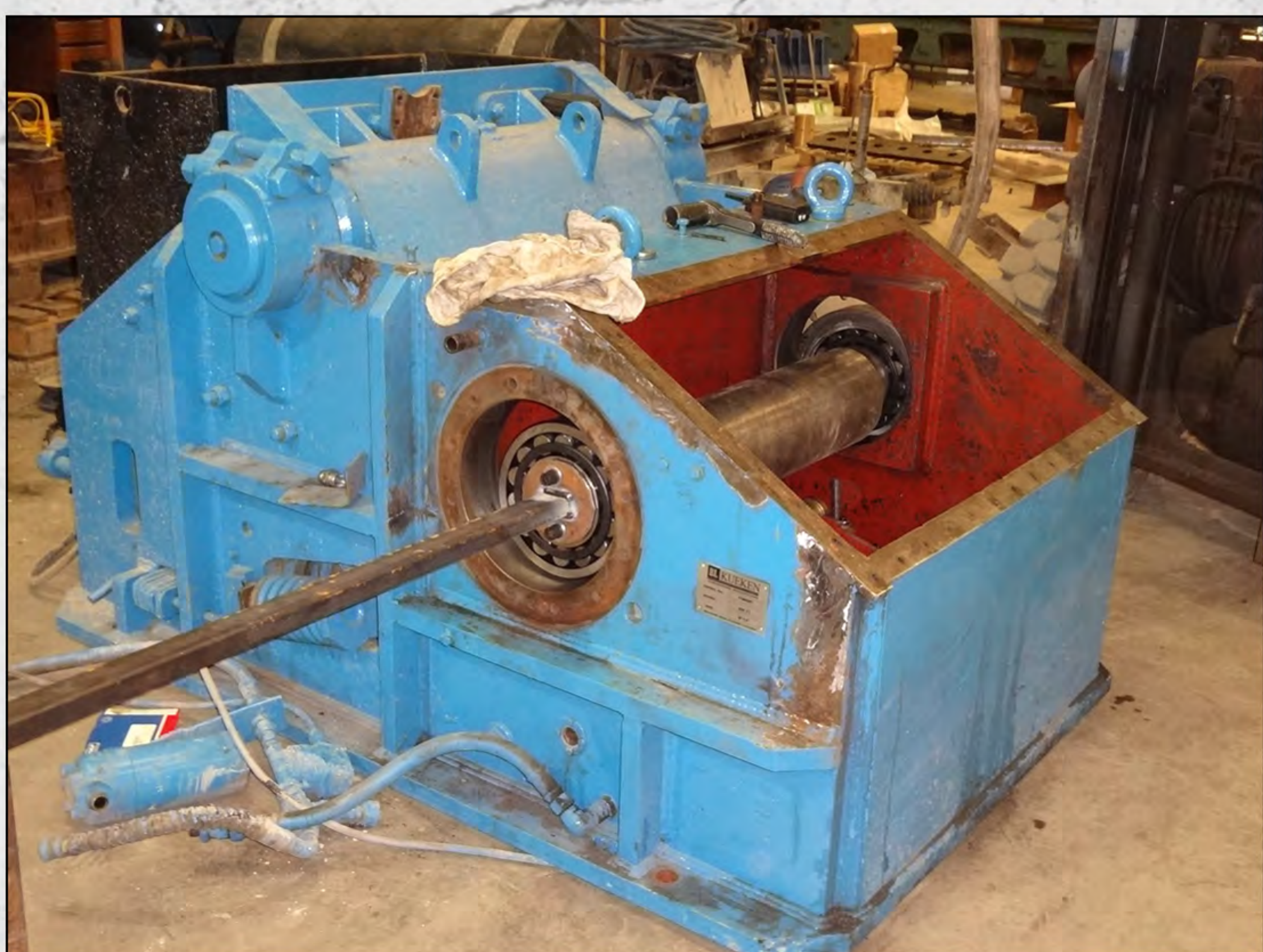
Kue Ken 71 Before