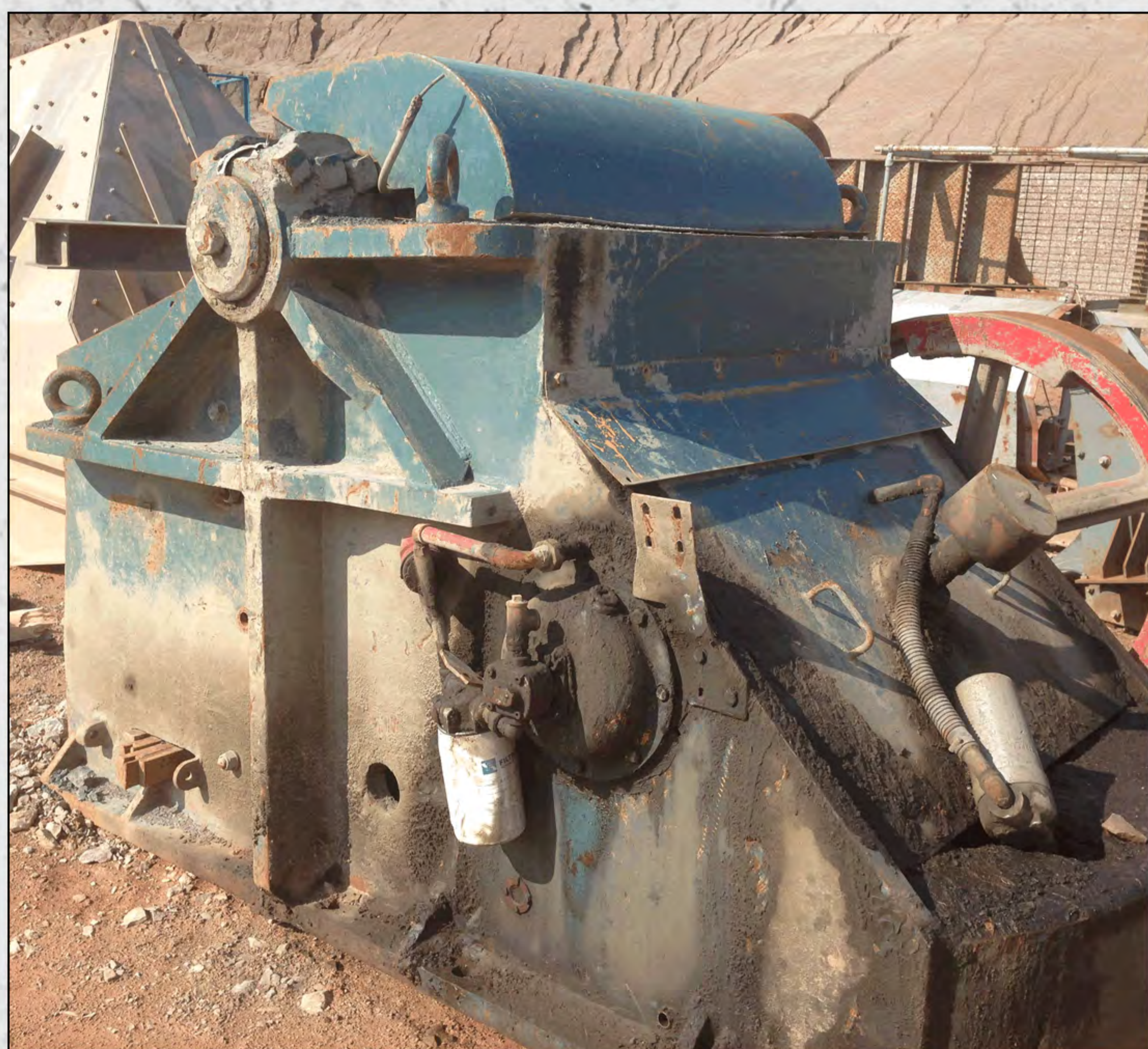
Kue Ken 42 x 10 Before