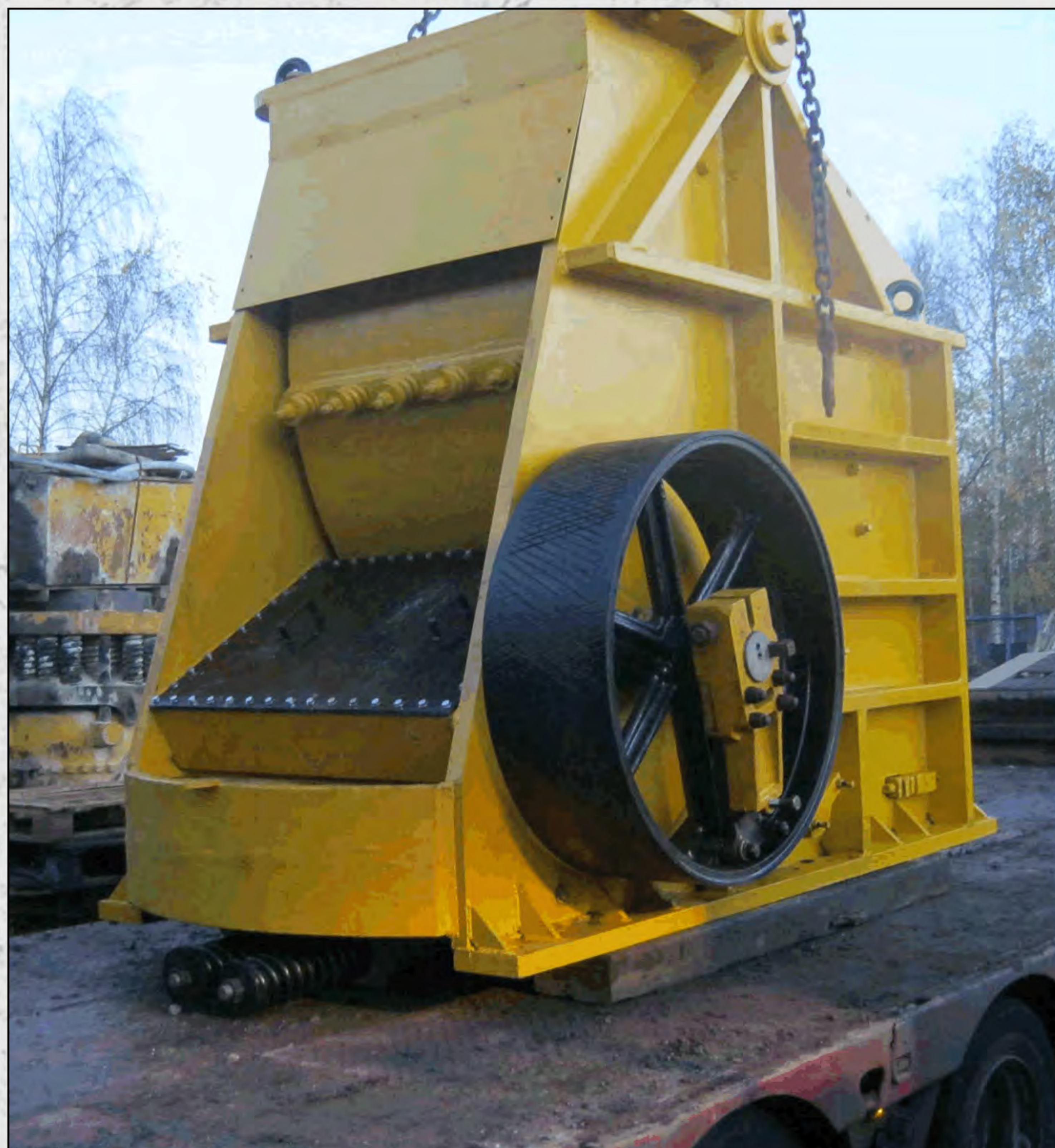
Kue Ken 120 After