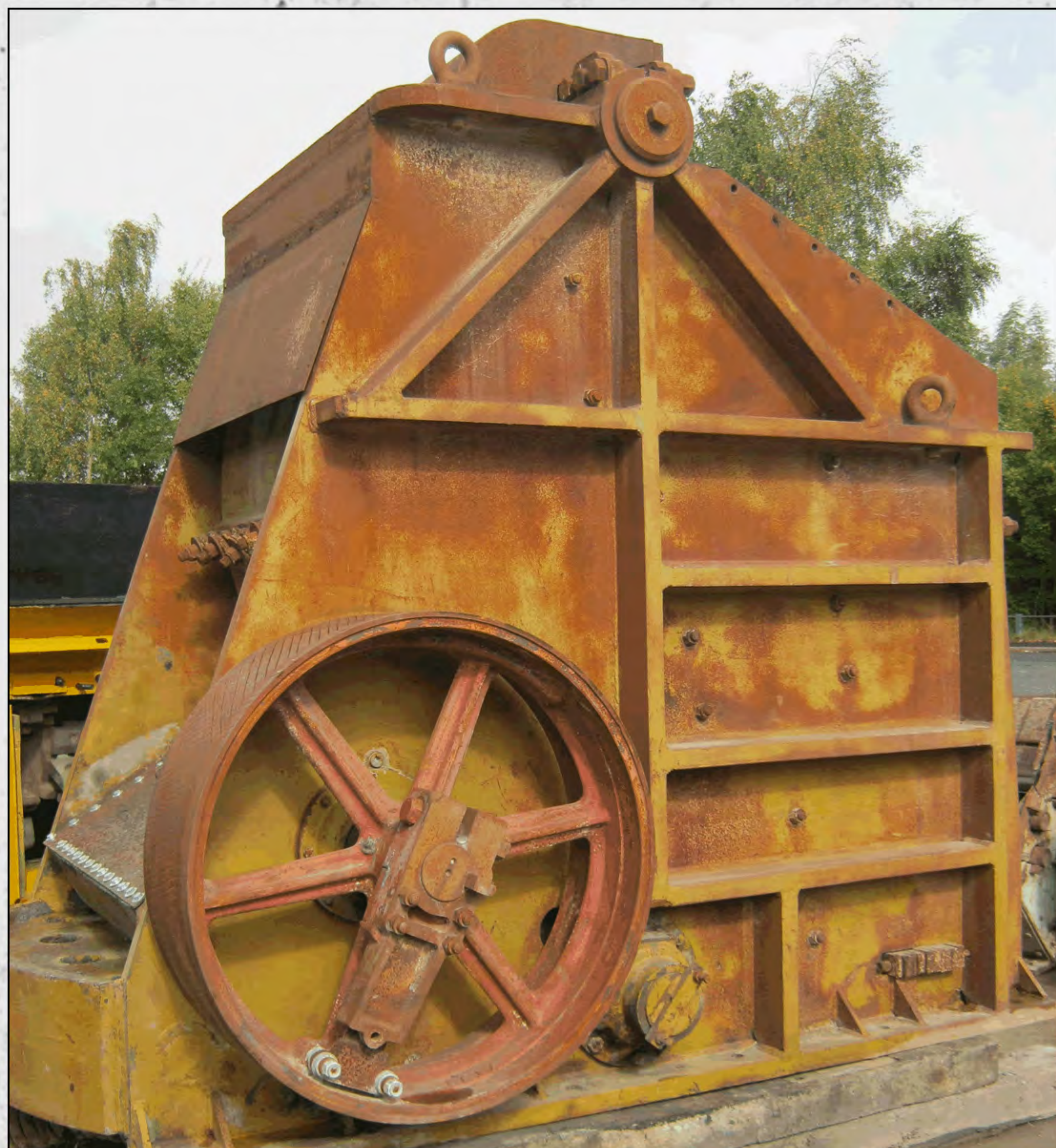
Kue Ken 120 Before