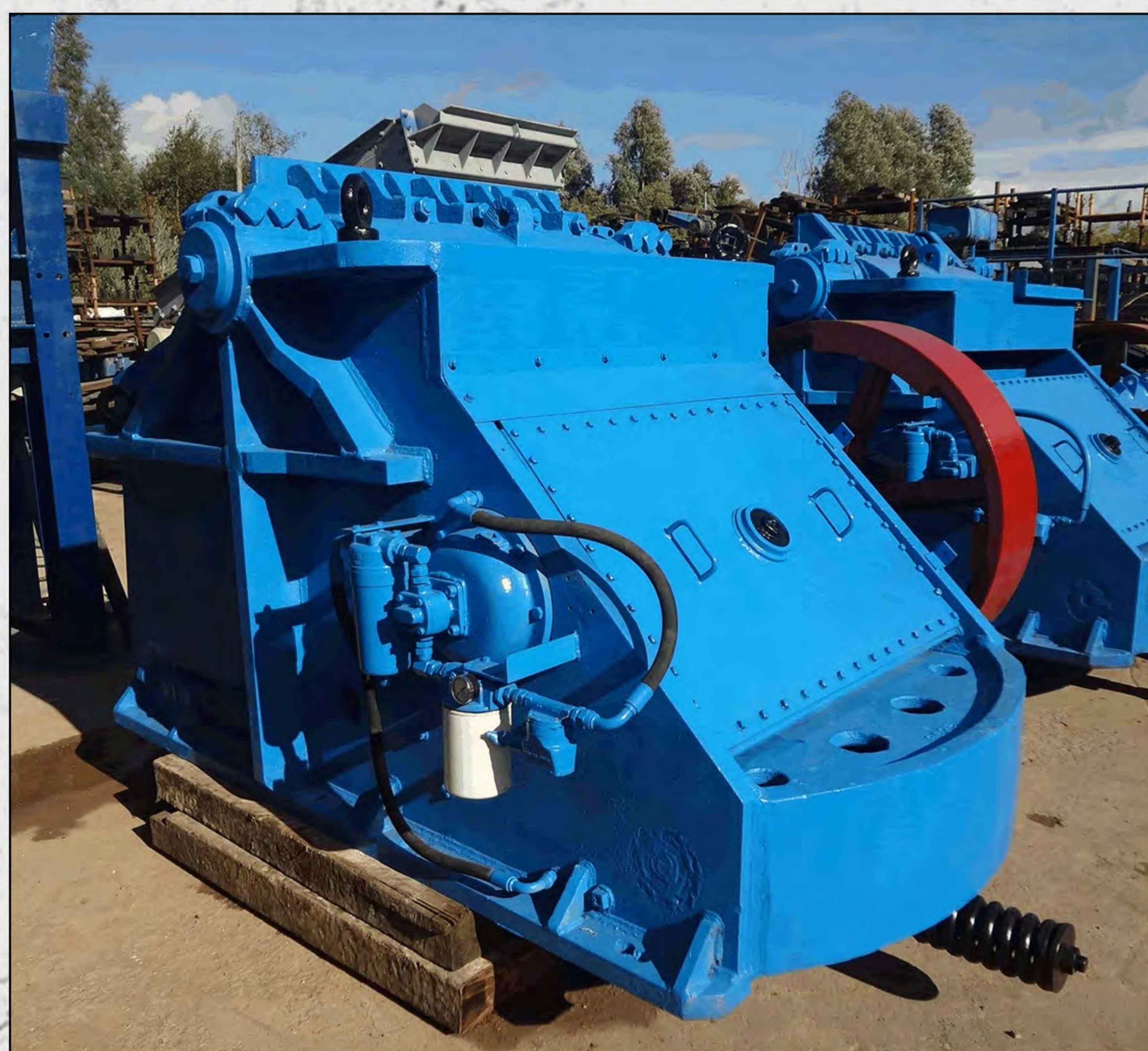
Kue Ken 42 x 10 After

Tel: +44 (0)1352 732284 Fax: +44 (0)1352 734633